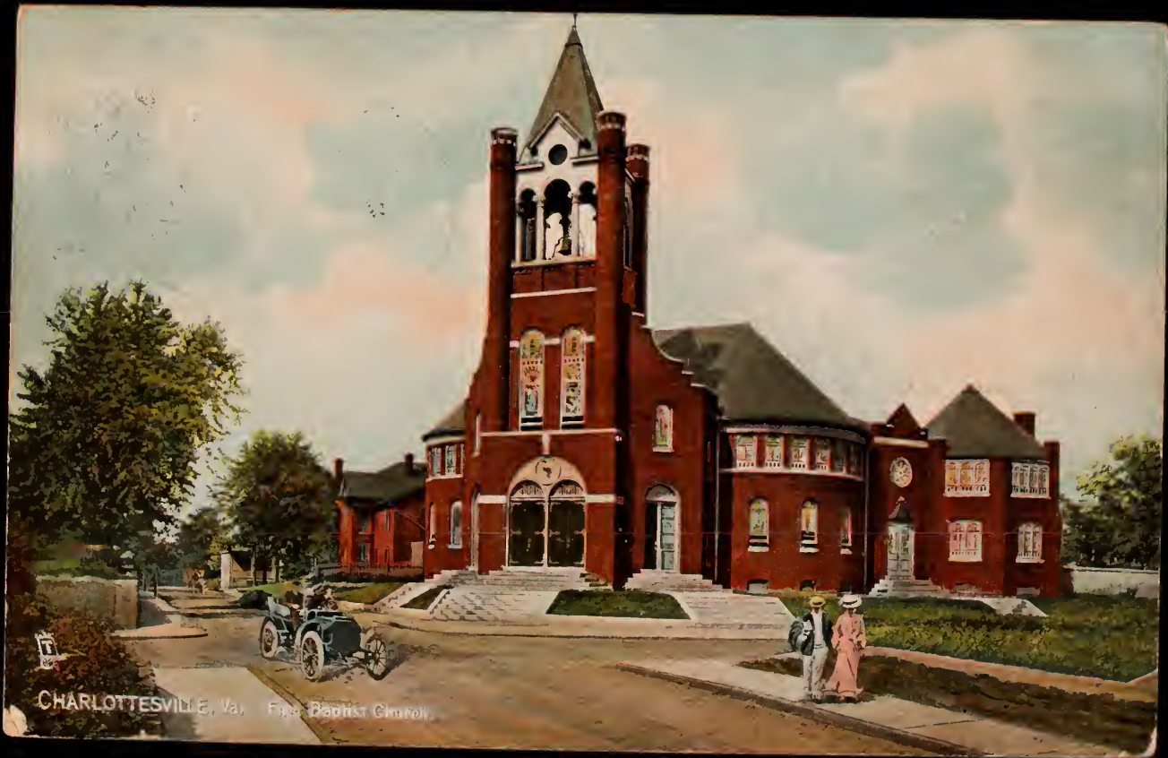
CHARLOTTESVILLE, Va. First Baptist Church.